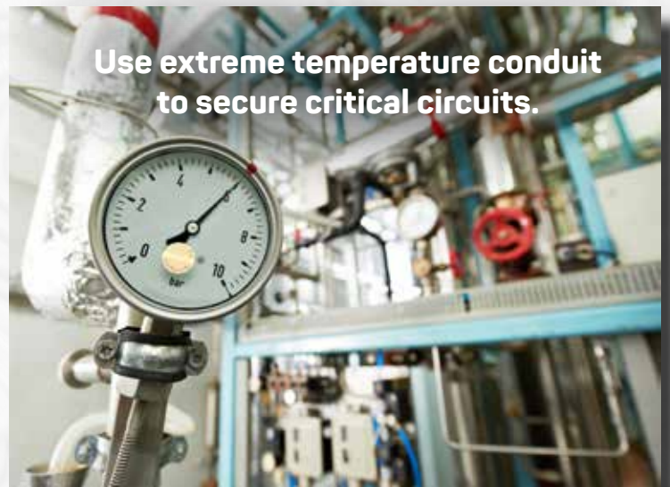
Use extreme temperature conduit to secure critical circuits.