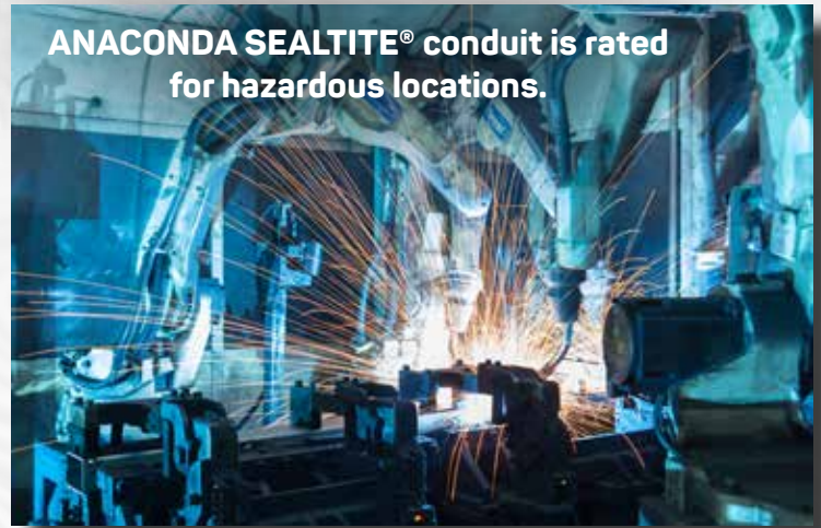
ANACONDA SEALTITE® conduit is rated for hazardous locations.