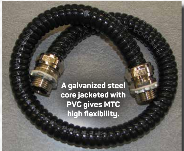
A galvanized steel core jacketed with PVC gives MTC high flexibility.