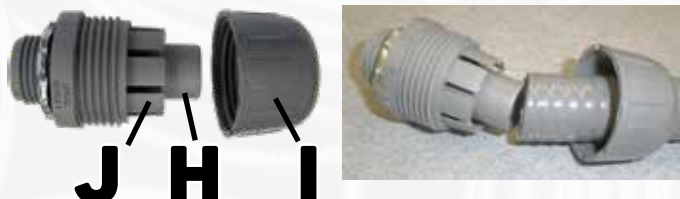
ANAMET Type B Fittings

Only Type B fittings provide a liquid tight connection on Type B conduit. Do not use Type A fittings on Type B conduit.