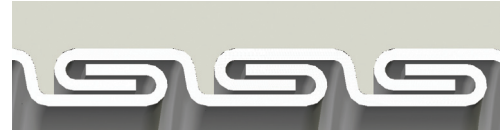
Interlocked Design 1-1/2" through 4" with no bonding wire