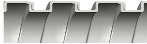
Square Locked Design 5/16" through 3/4"