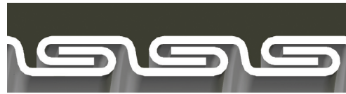
Interlocked Design 1-1/2" through 4"

www.naed.org www.nema.org www.anametelectrical.com