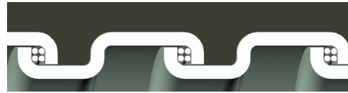
Square-Locked Design with cord packing 3/8" through 1-1/4"