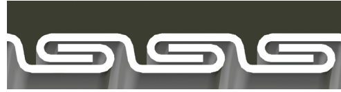
Interlocked Design 1-1/2" through 4"

www.naed.org www.nema.org www.anametelectrical.com